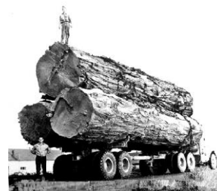
Timber Measurements Society