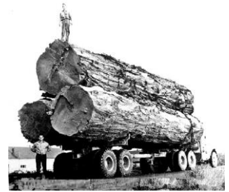
Timber Measurements Society