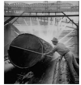
Timber Measurements Society