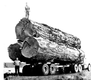
Timber Measurements Society