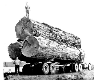
Timber Measurements Society