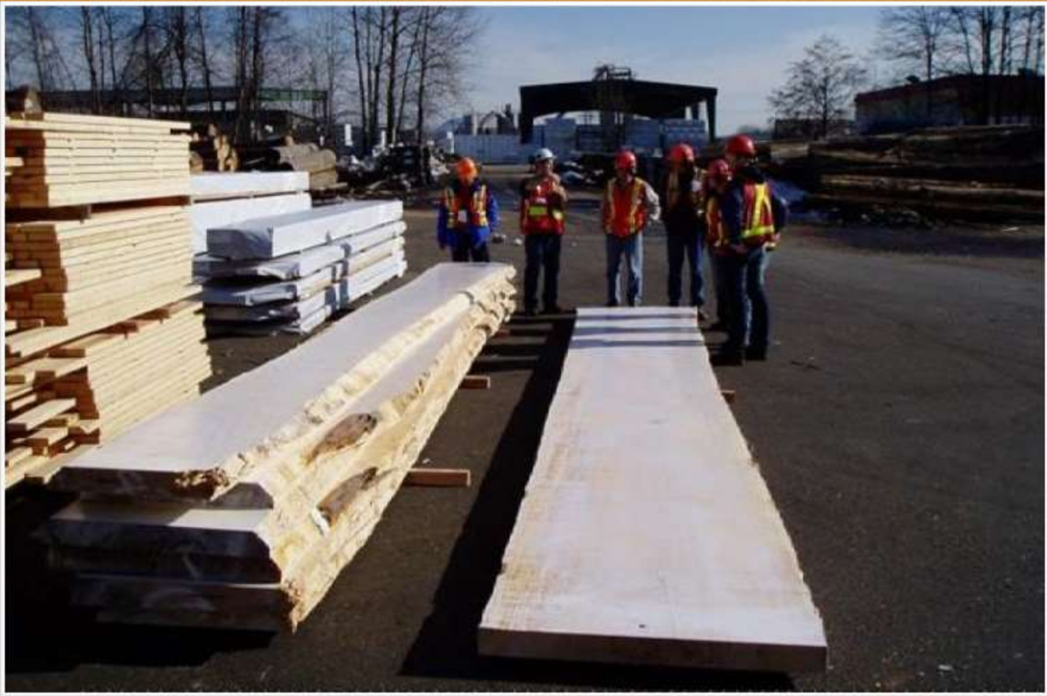
Cypress or Alaska Cedar Clear, 27ft x 4ft by 4inches