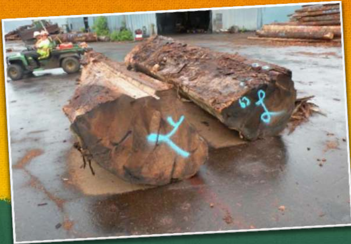
Large Irregular Timber