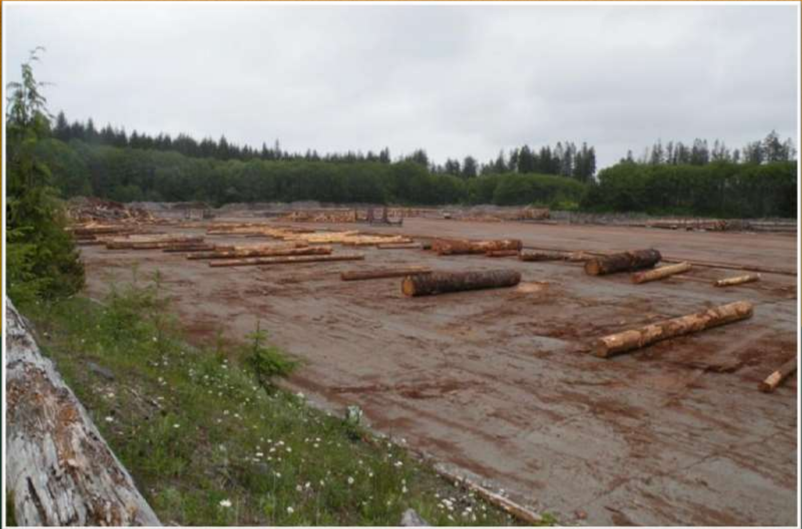
2014 Log Exam, Port McNeill B.C.